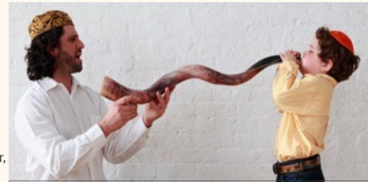
See how a shofar is made at https://torahlive.com/courses/shofar/visit-shofar-factory

The High Holidays are all about standing together, shoulder to shoulder, to pray for ourselves and our community. It is the only way to bring our voices together while hearing each other sing.