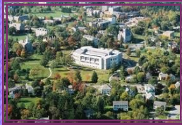
Middlebury College, Middlebury, Vermont

Now I am comfortable having conversations in Hebrew at an elementary level. It feels like I passed an important hurdle in learning how to use the Hebrew language.