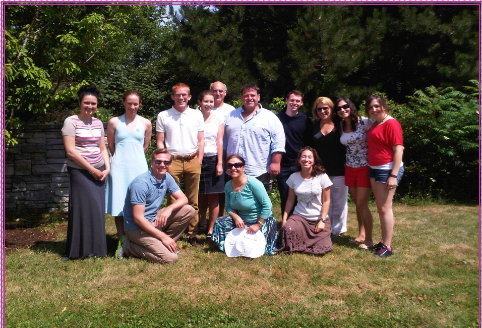
Middlebury College class picture

Now I am comfortable having conversations in Hebrew at an elementary level. It feels like I passed an important hurdle in learning how to use the Hebrew language. I am planning to continue my studies this fall with my Middlebury teacher, either in a class or a tutorial. I also will take an online class from Hebrew College, called Perkei Avot: Ethics of My Fathers. And, believe it or not, I plan to return to Middlebury next summer for another 3 weeks, hoping to spend my time there "swimming with Hebrew".