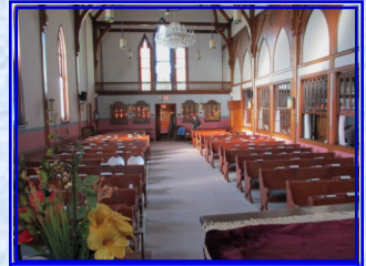
Etz Chaim photo 2012

We attempt to accommodate individuals along the entire spectrum of Jewish practice and theology. We value and support the existence of a local formal congregation, but view our community programs as open to all interested people, regardless of whether or to what congregation they may be formally affiliated.”