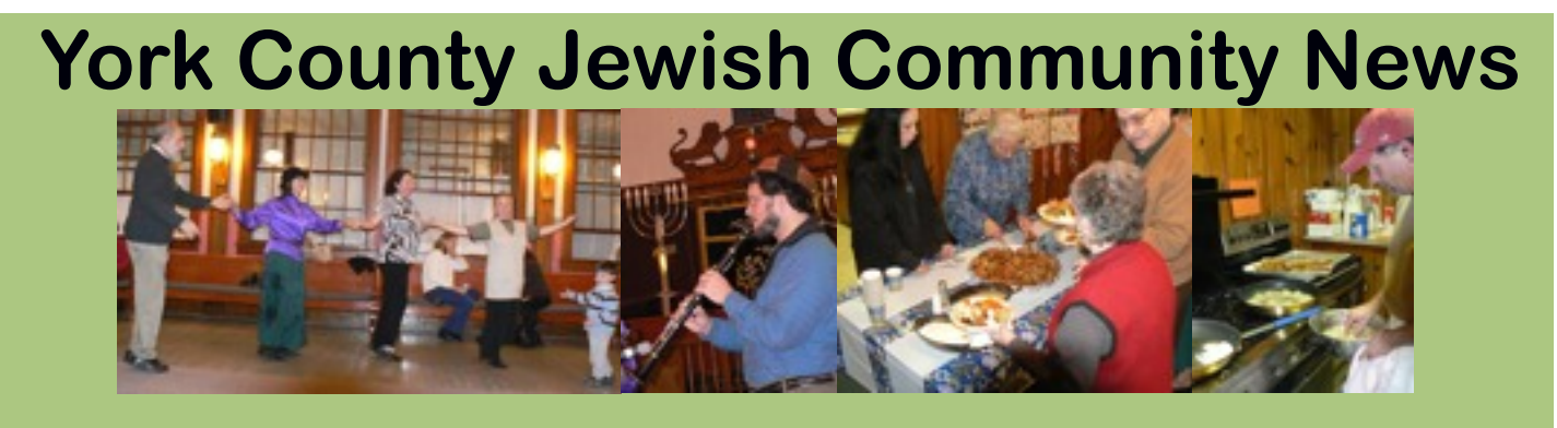
Chanukah Party at Congregation Etz Chaim: December 2007/Kislev 5768: Dancing, Swinging, Serving, Frying