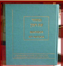
Machzor Eit Ratzon

After reviewing several recent options, and comparing them with our current book, the Ritual Committee has chosen Machzor Eit Ratzon as a replacement.