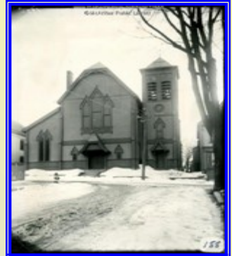
Etz Chaim photo 1916

We attempt to accommodate individuals along the entire spectrum of Jewish practice and theology. We value and support the existence of a local formal congregation, but view our community programs as open to all interested people, regardless of whether or to what congregation they may be formally affiliated.”