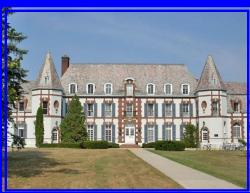
Middlebury College, Middlebury, Vermont

We each participated in a ceremony where we signed a pledge not to speak English for the duration of the program.