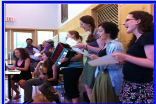
Singing in the Cafeteria